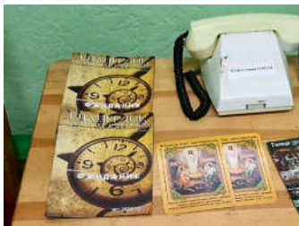
Our magazines at the entrance of a prison