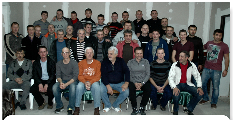
A large group assembled for the training.

Christian brothers from five different churches (in Georgia, Colorado and Washington) performed professional training in three areas: woodworking (cabinetry), tile installation, and auto body work. We are still looking for people who would be willing to step up and teach the art of plumbing installation. Each area has a huge potential for both trainers who teach, and trainees who learn useful knowledge and skills. We invite every experienced professional, in these and other vocations, to come alongside and make a real difference in the lives of people. God gives people a second chance in life, and He does it through people; some help show how to overcome addictions and some help teach how to work and earn a living! This is a God-given opportunity for believers to use their job skills in a way that gives those people a second chance!