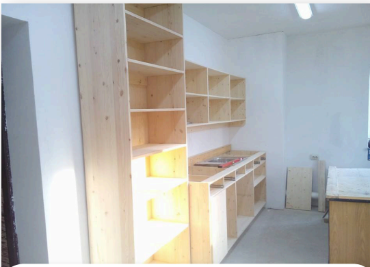
The men learning carpentry skills were able to learn much while working on the new kitchen.

The most important outcome was not the jobs that were completed, but that the people who finished rehabilitation, and now face the tough realities of the world, gained a head start with some needed knowledge and skills. What can we add to this?