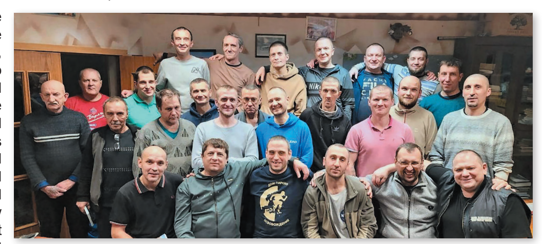
Alumni regularly visit and actively participate in the life of the Rumyantsevo Pirkko Home center.

After that, I contacted the brothers and they sent me another rehab center. Rumyantsevo Pirkko the Home. There I repented and completed the program by the grace of God. I really wanted to stop my sinful lifestyle. I was tired of running, suffering and almost dying! I hope the Lord hears me, forgives me and gives me strength for a new life!!! And for my part, I trust Him with my past, present and future!